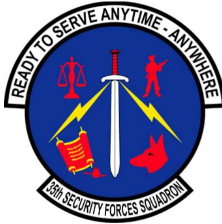
35 Security Forces Squadron